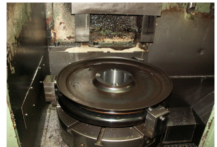
Precisely machined to your exact tolerances