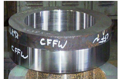
Stepped Hub to eliminate weld stress failures