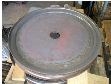
Roll Forged Sheave Donut